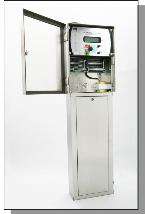
Small Pedestal Model Stainless Steel or Powder Coated Steel

For example: A central, 24-station, heavy duty stainless steel front entry pedestal would be specified as: WTPRO2S-C-24-SPH