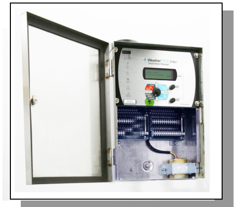
Wall Mount Model Stainless Steel or Powder Coated Steel

* See WeatherTRAK Product Catalog for complete line of controllers and enclosures